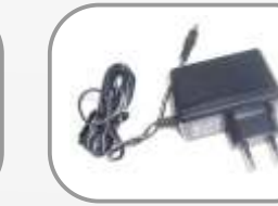
AC Adapter-Output 12V/1.25A Item No: AD112 Input: AC100-240V 50-60Hz, 0.5A Output: +12V 1.25A