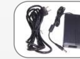
Battery Charger AC Adaptor - Output 12V/5A Item No: AD012 Input: AC100-240V 50-60Hz 70W Output: DC12V 5A