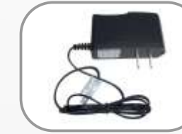
7.2V Ni-Cd/Ni-MH Charger (US Standard) Item No: TE202 Input: AC ~ 100-240V 50-60Hz Output: DC --- 10.5V 250mA MAX