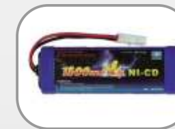
1800mAh 7.2V SC Ni-Cd Battery Pack Item No: NC618