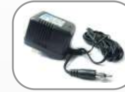
Glow Starter Charger (US Standard) Item No: TE102