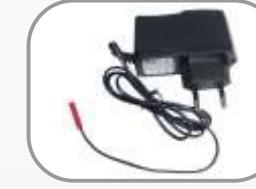
Receiver's Battery Charger (EU Standard) Item No: TE301 Input: AC~100-240V/50-60Hz Output: DC 10.5V / 250mA Max