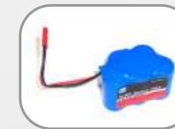
1100mAh 6.0V 2/3A Ni-MH Battery Pack Item No: NH511