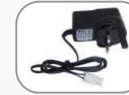
7.2V Ni-Cd/Ni-MH Charger (UK Standard) Item No: TE203 Input: AC ~ 100-240V 50-60Hz Output: DC --- 10.5V 250mA MAX