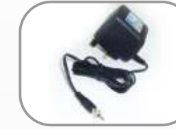
Glow Starter Charger (UK Standard) Item No: TE103