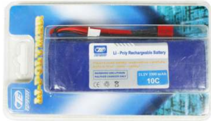
LiPo Rechargeable Battery – 11.1V 1500mah 10C