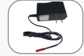
Receiver's Battery Charger (US Standard) Item No: TE302 Input: AC~100-240V/50-60Hz Output: DC 10.5V / 250mA Max