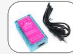
Balance Charger for Li-ion & Li-Po Batteries Item No: TEB3E Input: AC100-240V Output: DC 1.2A