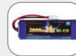
2000mAh 7.2V SC Ni-Cd Battery Pack Item No: NC620