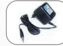
Glow Starter Charger (EU Standard) Item No: TE101 Input: 230V 60Hz 6.5W Output: 1.25V 300mA 0.37VA