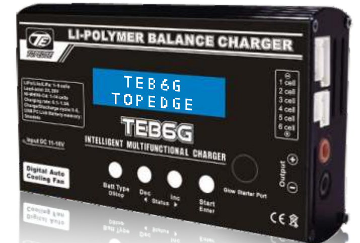
Black Li-Polymer Balance Charger