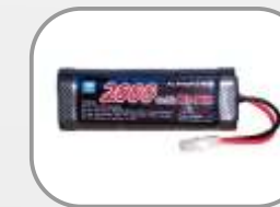
2000mAh 7.2V-SC Ni-MH Battery Pack Item No: NH620