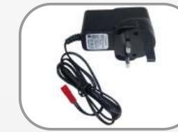
Receiver's Battery Charger (UK Standard) Item No: TE303 Input: AC~100-240V/50-60Hz Output: DC 10.5V / 250mA Max