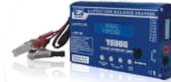
Blue Li-Polymer Balance Charger