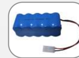
2000mAh 12V SC Ni-CD Battery Item No: NC1020