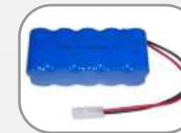
1800mAh 12V SC Ni-CD Battery Item No: NC1018