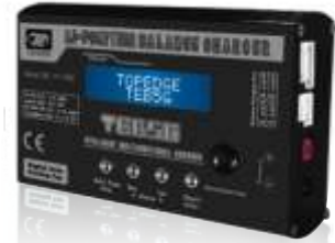
Black Li-Polymer Balance Charger