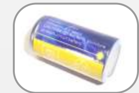
1800mAh 1.2V SC Ni-Cd Battery Item No: NC118