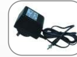
Glow Starter Charger (Australia Standard) Item No: TE104