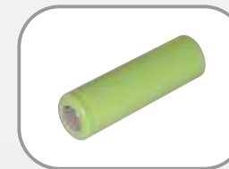
Ni-MH AA 1600mAh Rechargeable Battery (for glow starter, etc.) Item No: 55103