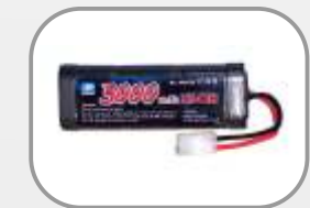
3000mAh 7.2V-SC Ni-MH Battery Pack Item No: NH630