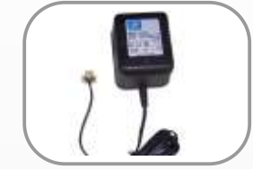
7.2V Ni-Cd/Ni-MH Charger (US Standard) Item No: TE202-2 Input: 120V 60Hz 12W Output: 7.2V 3.50mA