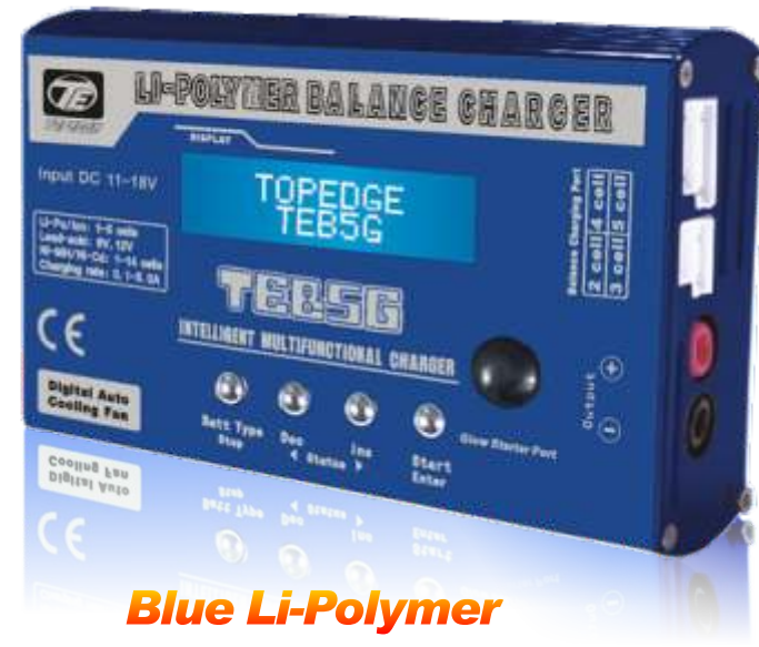
Blue Li-Polymer Balance Charger