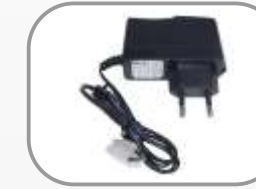
7.2V Ni-Cd/Ni-MH Charger (EU Standard) Item No: TE201 Input: AC ~ 100-240V 50-60Hz Output: DC --- 10.5V 250mA MAX